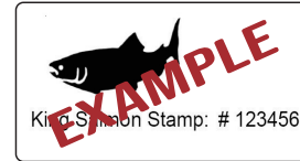
Online king stamp