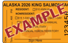
Physical king stamp

Examples of both a physical and an online king salmon stamp are shown below.